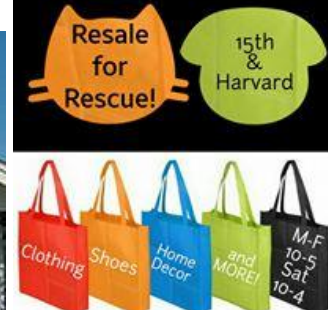
Amazing values on all clothing perfect for Fall & Winter!

Donations are accepted Mon - Fri from 10am until 2pm and Sat from 10am until 2pm.